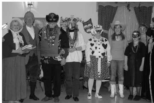
A few of the winners of the costume contest at Fasching 2009